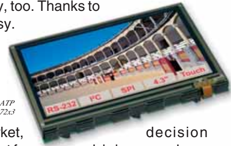
EA eDIPTFT43-ATP 4.3" - 480x272x3

In recent years TFT displays came to the top for mobile phones, PDA and digital cameras. It stands to reason that more and more industrial applications like to be equipped with a coloured display, too. Thanks to the colours, process parameters or limit exceeds can be highlighted very easy. Simultaneously a coloured TFT display point up the valence and the product image of your equipment. Last but not least the non-reached brilliance and the excellent contrast satisfy even sophisticated guys immediately.